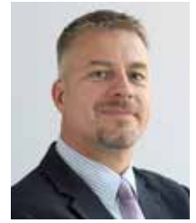
Ian Maund Testifying Expert